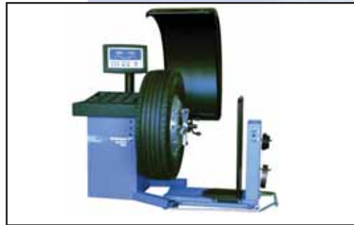
Heavy duty wheel balancer for truck, bus, RV, and automobile/light truck tires.